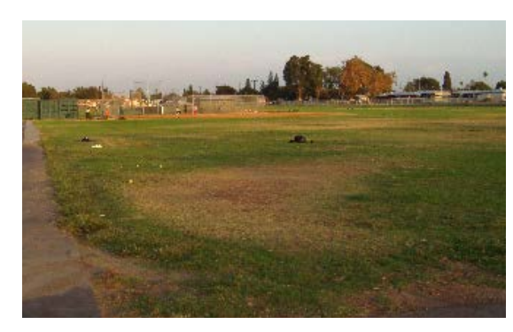
Need to recondition fields.