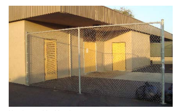
Need 4,000 l.f. of fencing to secure campus.