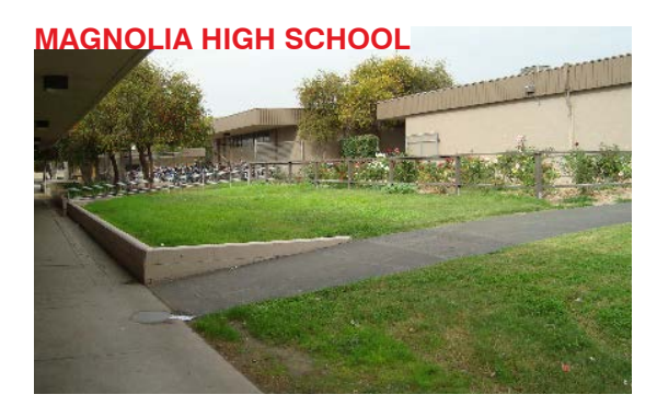
Need to replace 15 portables with permanent classrooms.