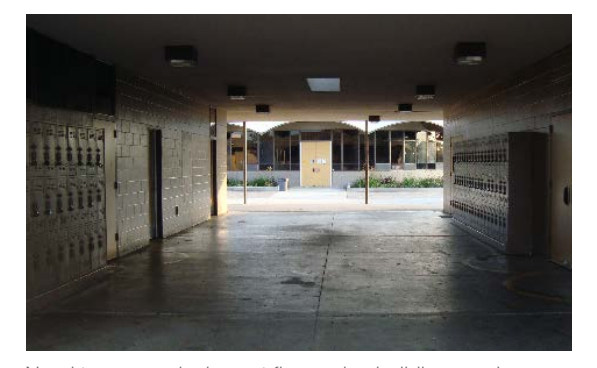
Need to remove lockers at finger plan buildings and courtyard.