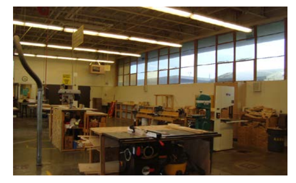
Most campus windows are old and need replacement.

ANAHEIM UNION HIGH SCHOOL DISTRICT Facilities Master Plan