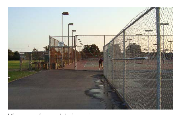
Minor ponding and drainage issues on campus.