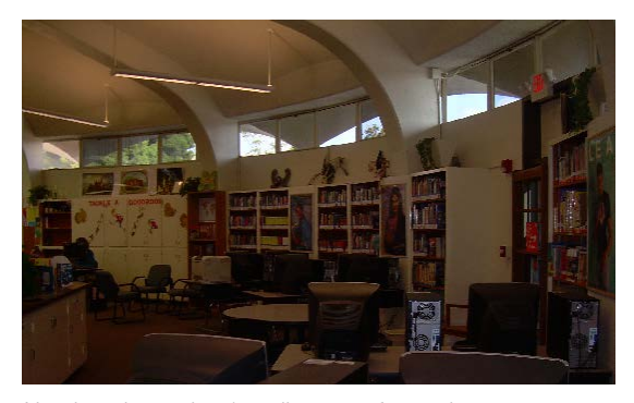
Need student union / media center for student interaction and collaboration.