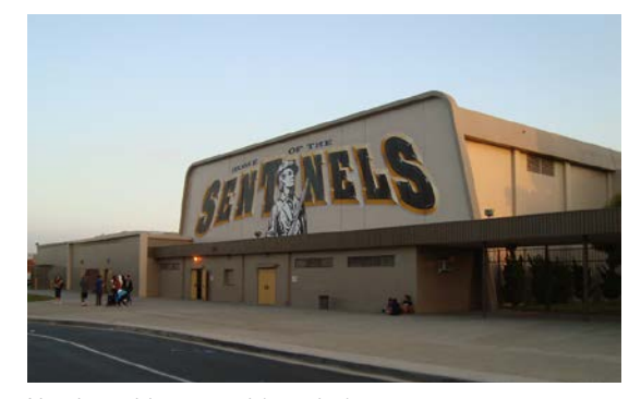
Need to add a second (practice) gym.