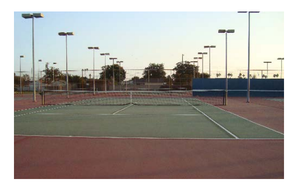
Tennis courts need to be replaced.